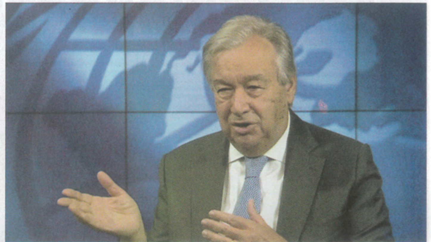
The United Nations Secretary-General His Excellency António Guterres delivered a speech at the convention.