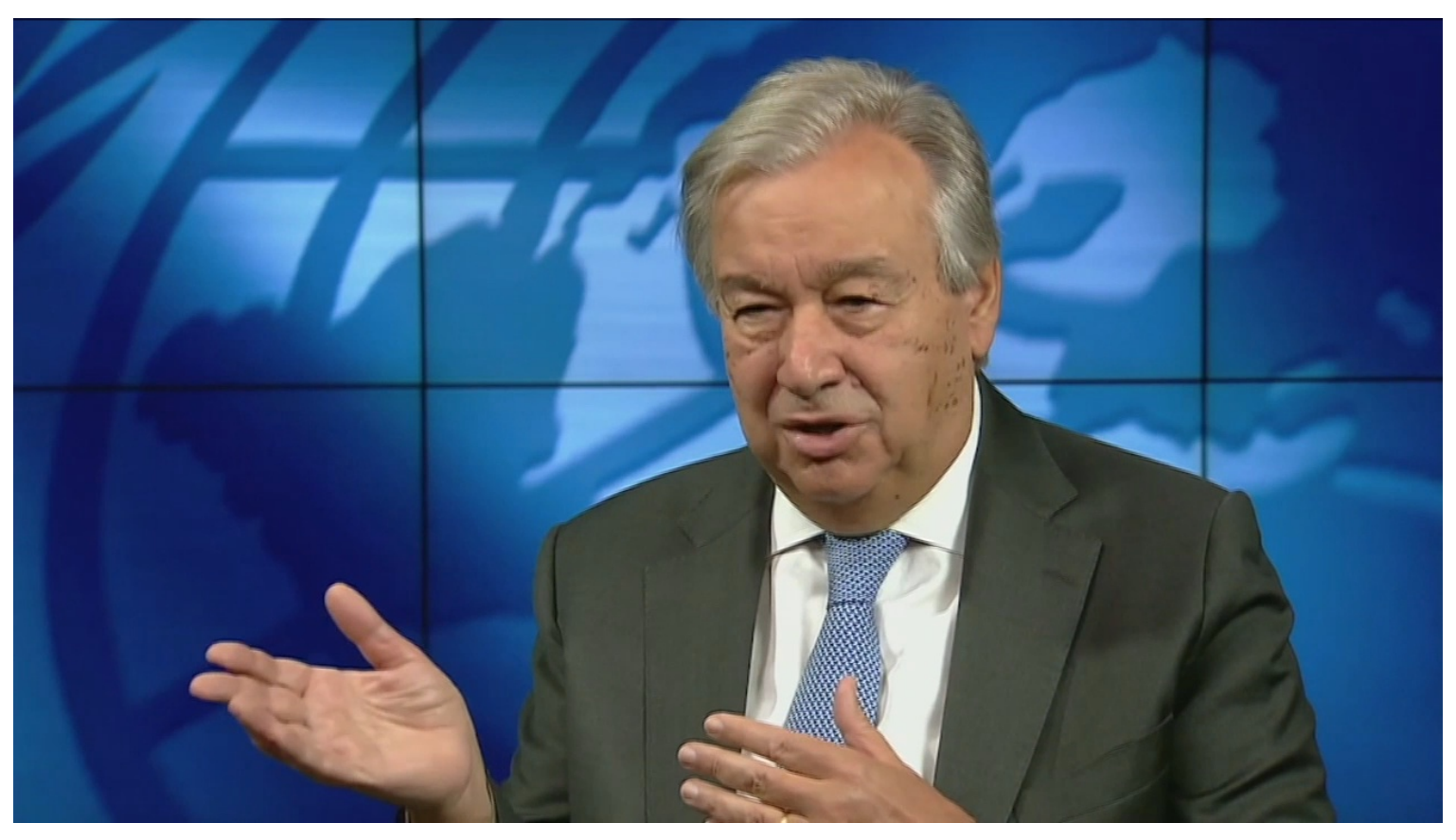
The United Nations Secretary-General His Excellency António Guterres delivered a speech at the convention.

On December 20, the UNESCO convention was held on the occasion of the 2020 United Nations International Day for Human Solidarity, and the United Nations Secretary-General His Excellency António Guterres attended in person and delivered a speech.